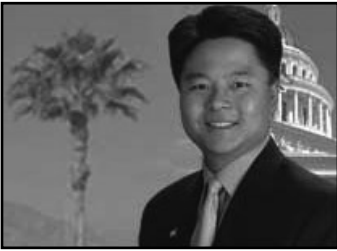
Assembly Member Ted Lieu, 53rd District.

The El Segundo Chamber and Chevron, El Segundo Refinery will present Assemblymember Ted Lieu's First Chamber of Commerce Address at 7:30 am on December 7, 2005 at the Manhattan Beach Marriott.